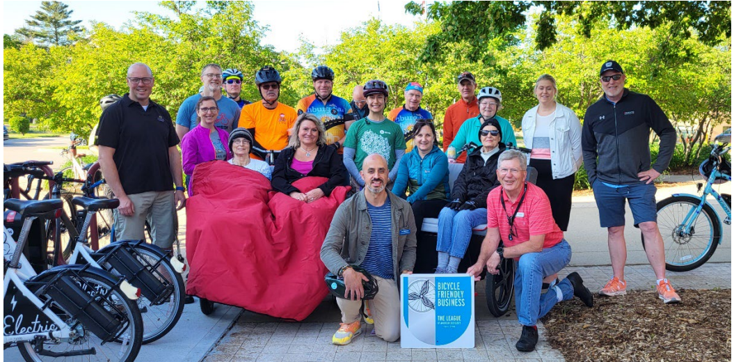
Fitchburg's Bike to Work Day and Bicycle Friendly Business celebration, May 17, 2024